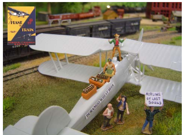
Animas Airways - "fly with lost souls".

Animas Airways "THE AIRLINE OF LOST SOULS" had the airship spray painted at Benny Fenders auto repair shop in Durango with an undercoat