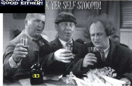
With Durango Wheat's at the Silverton Hotel Colo.

The posse made it to the water tank coor's the injun was whoreful thirsty. But that sneaky snivillin' skunk was a waitin' fer em, his injun had ova-heated & sum flues had flown water leakin'. He had bin hidin behind the boxcars in the yard & sprung out wheeldin' his pearl handled six-shooter's.