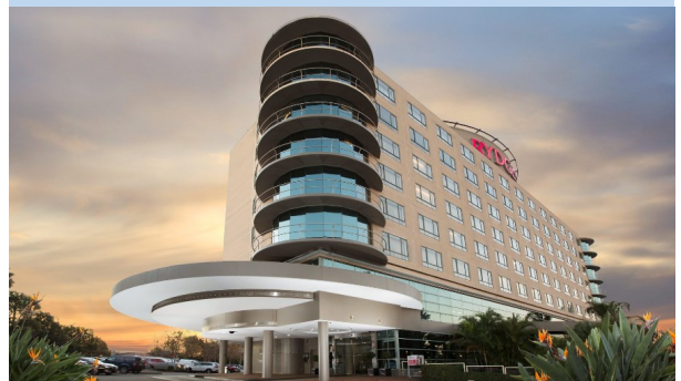
Host Venue: Rydges Parramatta

Accommodation: Available at Rydges, and other venues nearby