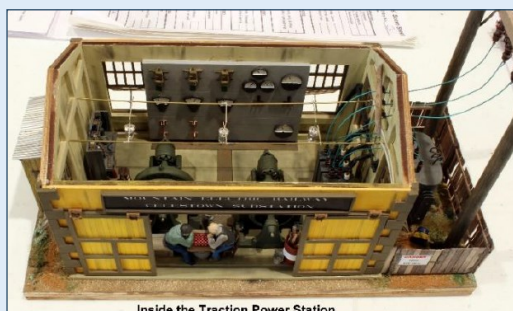
Inside the Traction Power Station

These are some photos of previous entries: