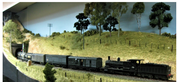
A C36 hauled 350 ton goods train entering the 1500 foot Ardglenn Tunnel on the Main North railway line close to the New England Highway on the North West Slopes region of NSW.

Excessive temperatures in the Cab travelling 10mph up the 1in 40 grade, required the "Helper" loco to be attached to the rear of the train at Murrumbidgee.