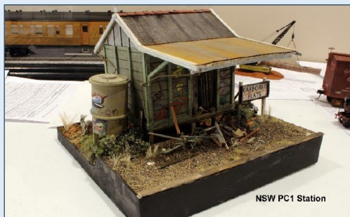
NSW PC1 Station