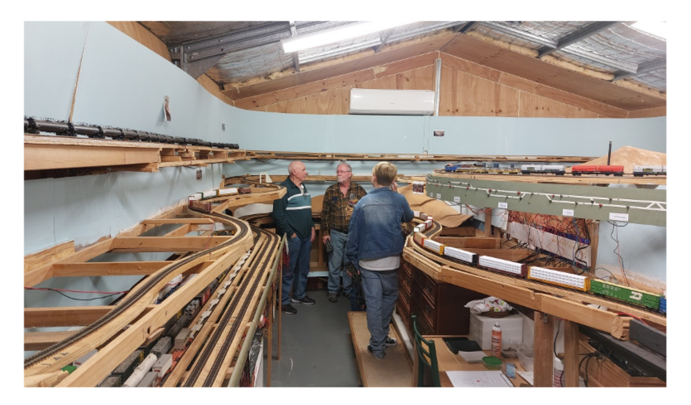
Check the NMRA AR Convention website for more details: <u>Tehachapi Pass – National Model Railroad Association Inc.</u>