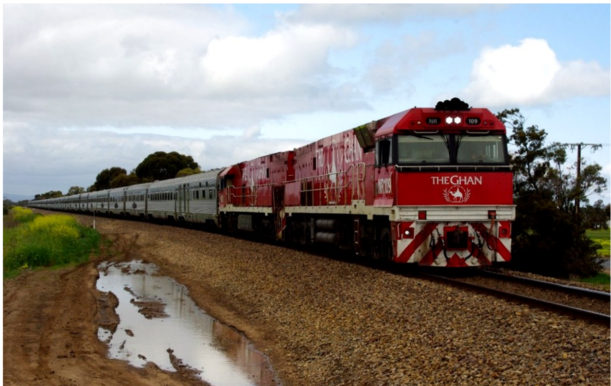
The Ghan with its 39 carriages en route to Darwin with Brian and Fran