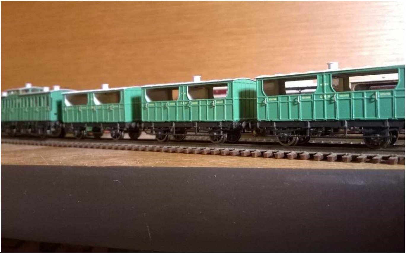
Open second class carriages as well as an 8 wheel mountain radial all painted in early days second class green.