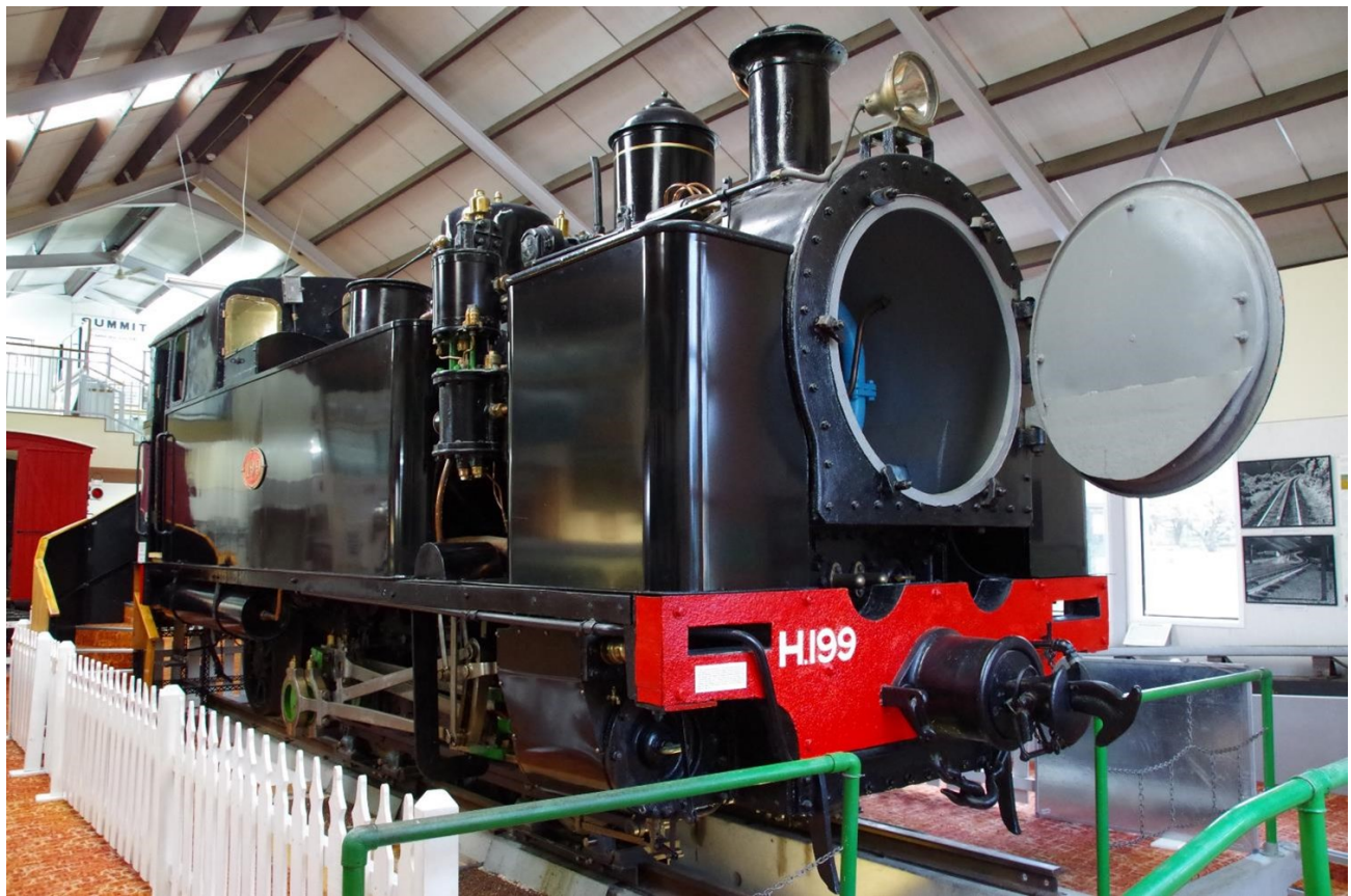
Mystery photograph: What is this steam locomotive and where is it currently located?