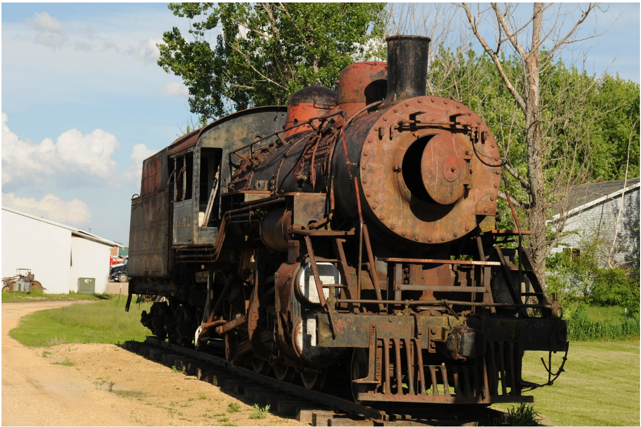
Mystery photographs: A couple of photos to really stretch the grey matter