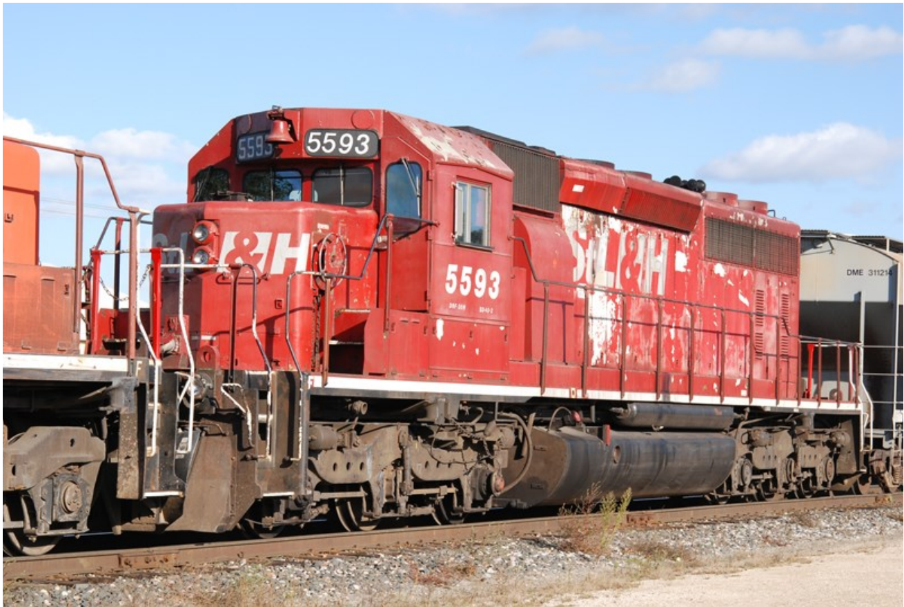
Mystery photograph: What is this diesel locomotive and where might it be running?