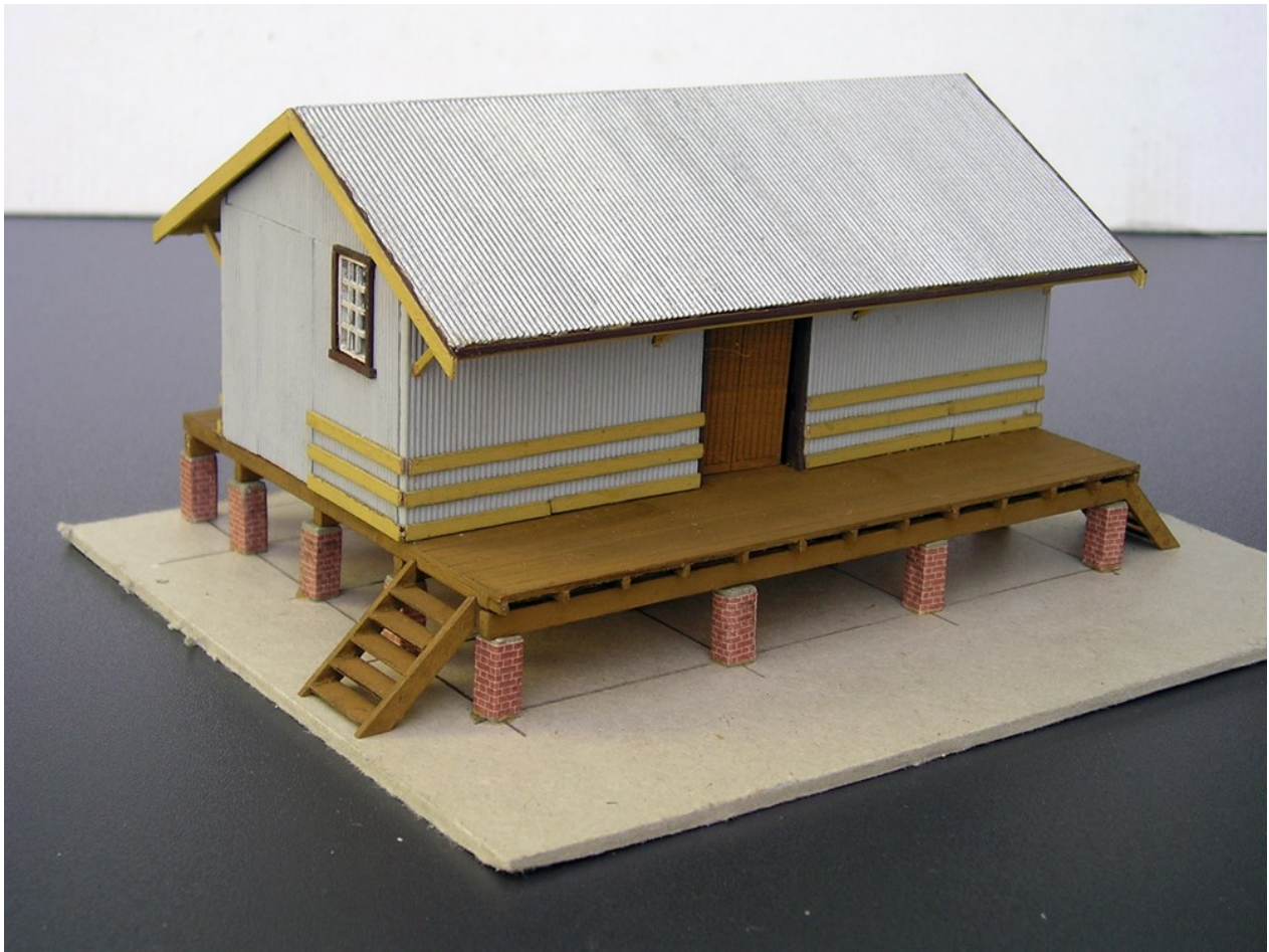
Ladysmith goods shed (above) and Humula goods shed (below) as built by Rob Nesbitt