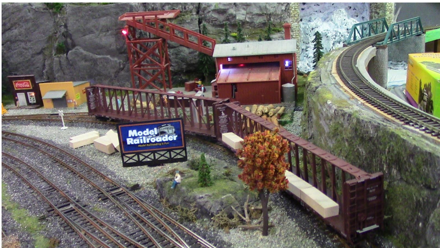
Just one of the small yards