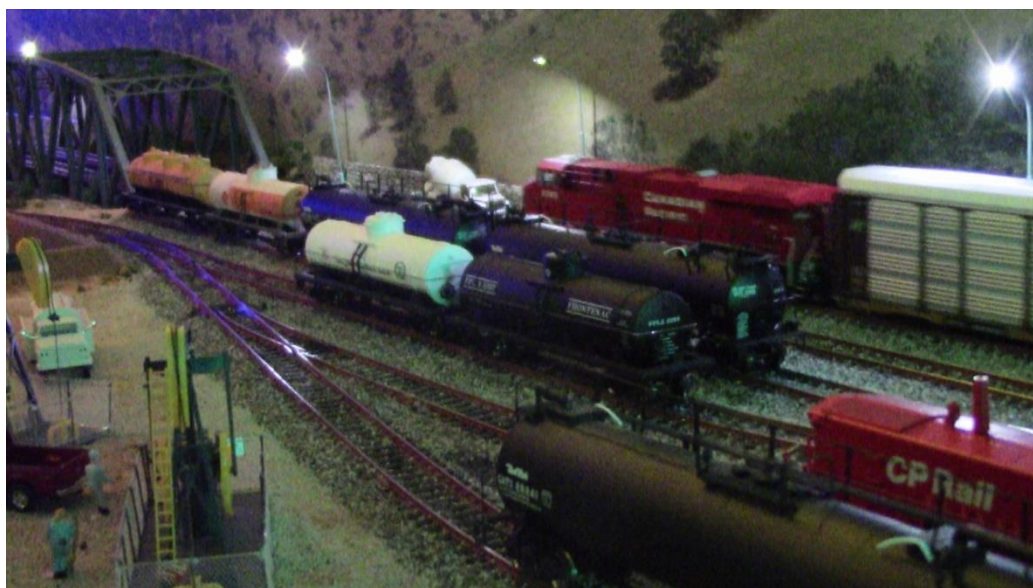
Notching up, powering up the grade with ease.

Day turns to night where the multitude of coloured LED's does tend to affect the frequency spectrum of the digital camera lens to filter the colours, however starting its journey a single CP GE AC4400 with an auto rack consist slowly moves along the mainline from the yard towards the bridge.