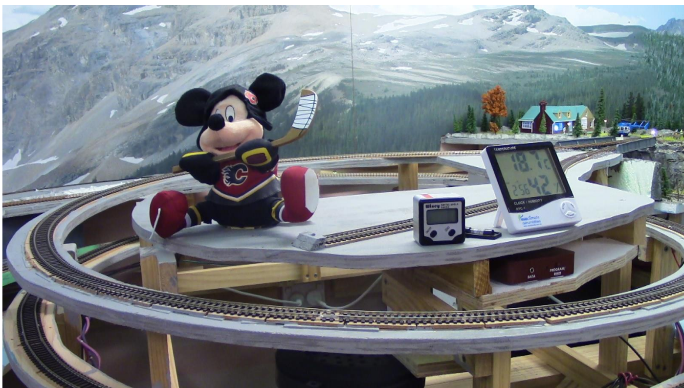
Mickey quietly sits on the helix looking for the 'puck'.

Door closed, three joining sections placed at the door, 'there is now no escape' until the running session ends as consists selected as routes being selected for those scheduled runs.