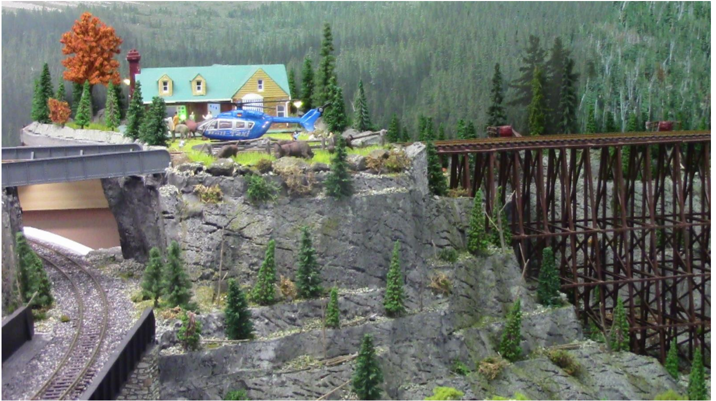
The backdrop blends well into these foreground scenes.