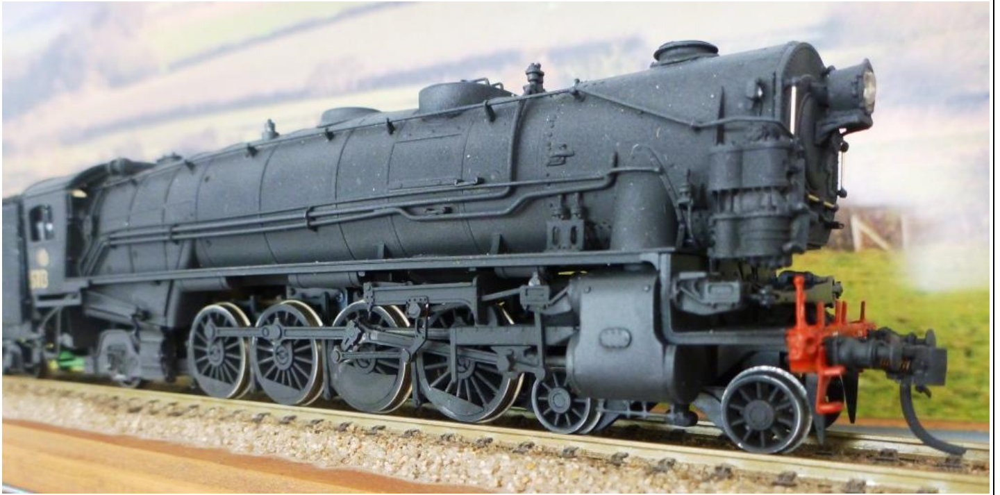
Photograph's showing the detail as the nice painting applications.