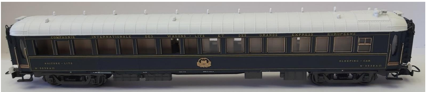
The Rivarossi Venice Simplon-Orient Express collection as the set