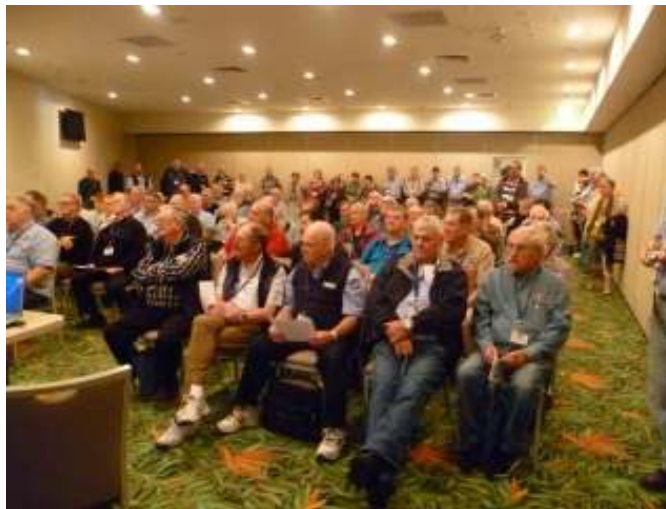
Convention Attendees at the Opening Address