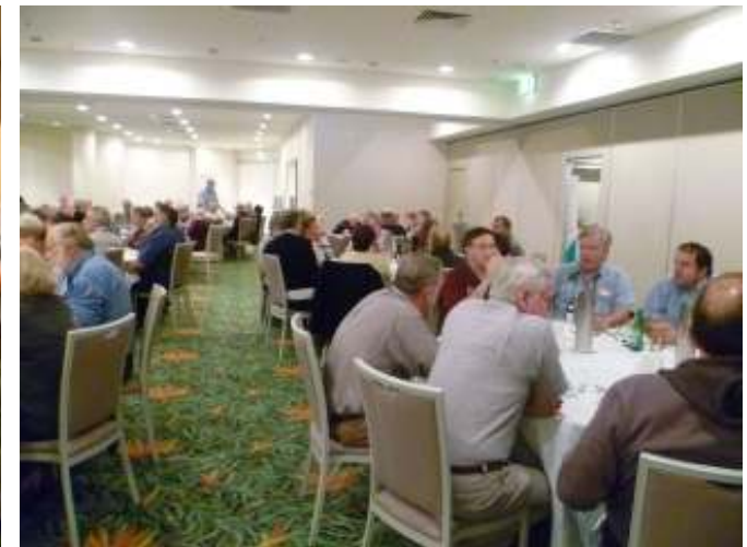
The Convention Dinner (two photos)