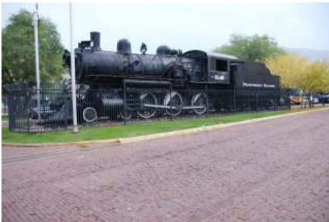
Northern Pacific 1356 outside Northern Pacific building

The next day went out to Fort Missoula where there is equipment that was used in the logging industry including a railway station, Shay Locomotive, log crane and several logging related rolling stock.