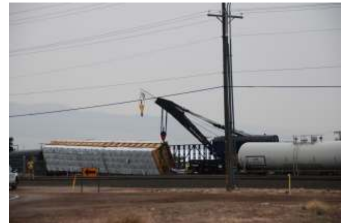
Crane lifting beam car back onto the tracks