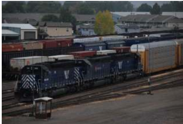
MRL 318 SD45, 382, 351 SD45XR locomotives passing through the Yard heading for Butte