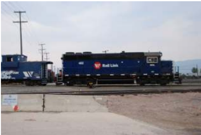
MRL 402 EMD GP35 Shunting in the yard

First thing in the morning I checked out the Montana Rail Link yard in Missoula. Whilst driving beside the yard spotted a lumber beam car off the rails and in the ballast with 5-6 people standing around. About an hour later the crane arrived and they commenced slinging it to lift it back on the track this only took them about 2 hours to complete and remove the beam car. As we were watching this event there was a bit of action on the mainline which was not possible to see from where I was.