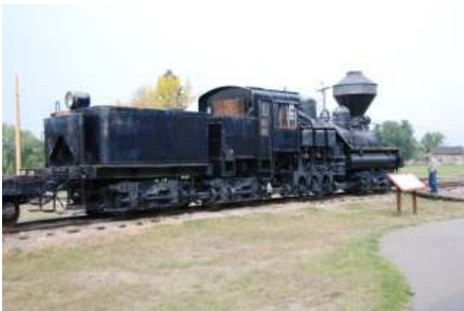
Western Lumber Co. No.7 Willamette Iron & Steel Shay