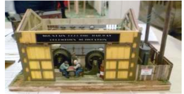
Electrical Substation built by George Paxon