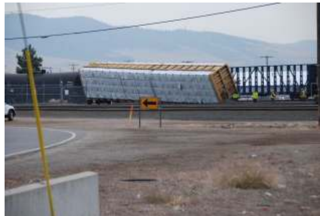
Beam car of the track and in the ballast

Noticing an overhead bridge decided to see what was happening on the other side of the yard from the bridge. There was a work crew removing a spur line and 3 SD45s heading to Butte on an adjacent track