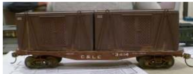
Containers on flat car by George Paxon