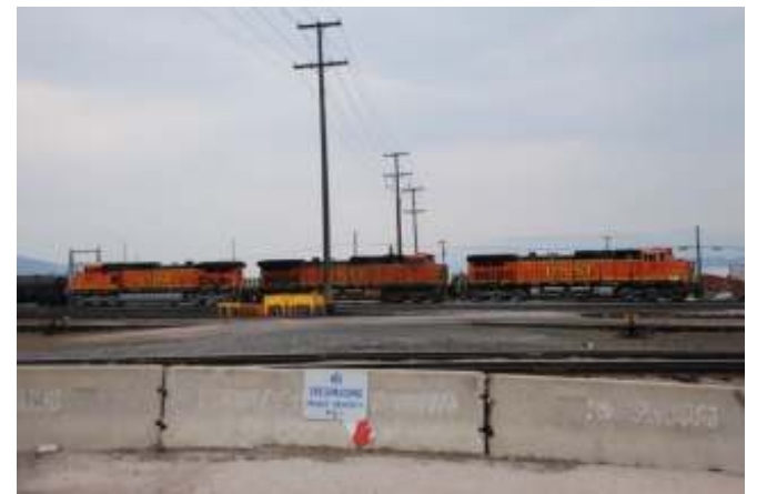
BNSF 5517,5015 & 4097 GE C44-9W passing through the yard

MRL 402 GP35, GTW 6355, Built as DTI 355 MRL 318 SD45, MRL 8906, SP 7544, Built as SP 8906 MRL 382 SD45, VMX 8929, CSX 8929, SBD 2029, Built as SCL 2029 MRL 351 SD45-2XR, NHL 6445, BN 6445, Built as GN 415