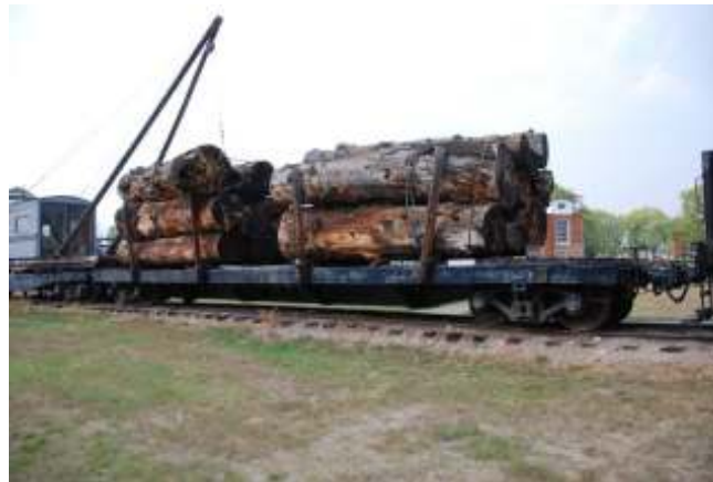
Log load on modified flat car

If travelling through Montana Missoula is well worth the stop as it is quite a large town with plenty of restaurants etc.